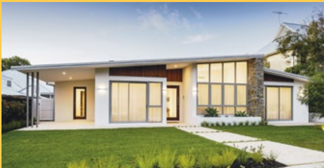
Oswald Homes The MCM Skillion roof and substantial glazing

This Architectural Style – Colours & Materials brochure should be read in conjunction with the full Design Guidelines (Annexure A of your land sales contract).