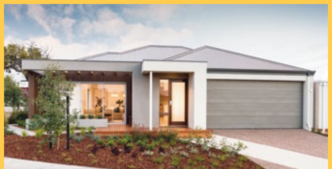
Go Homes The Makani Verandah element accessed directly from living area