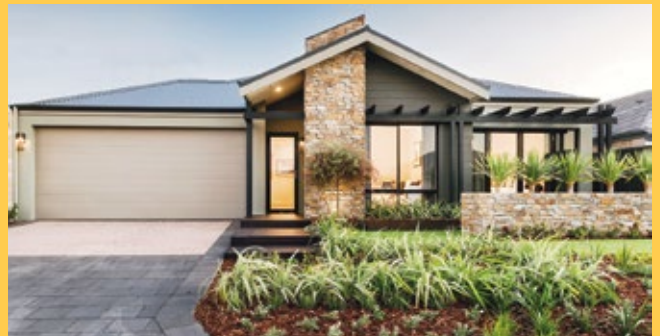
Go Homes The Dakota Gable-end roof feature, attached pergola, dry-stacked stone