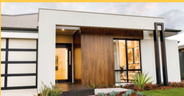
Go Homes The Carlisle Portion of flat roof, vertically proportioned timber cladding