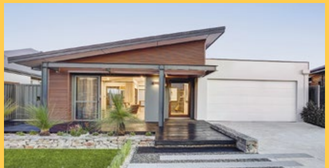
Summit Homes The Australiana Skillion roof and steel pergola structure